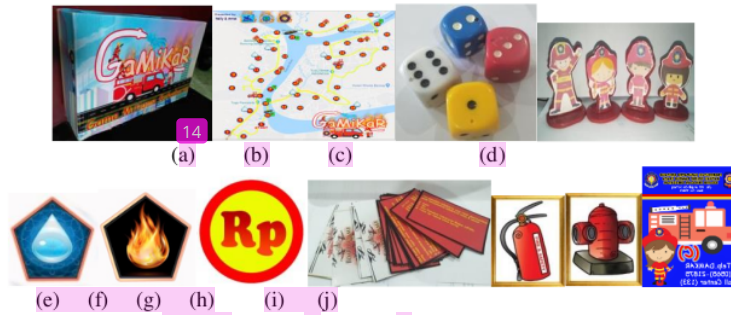
Figure 2. The set of contents in a game Gamikar

Gamikar is a medium designed as an educational tool to increase students' understanding of fire disaster mitigation. The set of contents in a game box is a) cover b) game board, c) pawns, d) dice, e) water pin, f) fire pin, g) coins, h) question card and i) fire extinguisher card.