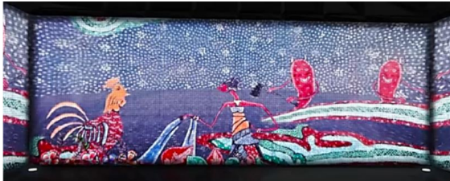
Figure 4. The virtual room is made full screen with batik artwork that has been made into an animated space, so that it appears that the exhibition tends to be more dynamic and interactive than the virtual gallery which displays works of art lined up to the left and right.