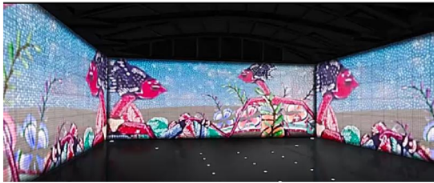
Figure 3. Subject matter that is considered important is cropped, then made into animation, and displayed in space.

Usually, the structure of most virtual exhibits is determined by the structure of the exhibition space [22] which consists of two types of elements: Virtual Gallery and Subject matter. Exhibition is the primary means by which artists convey their mission objectives and can be static or interactive.