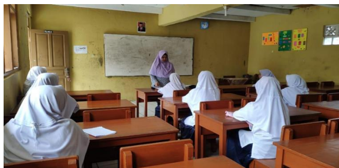
Figure 4. Implementation of extensive trials at MTs Ummi Kulsum

In processing activities, students and their groups work together to discuss the contents of the notes (talk process), then individually make writing (writing process) in their language into descriptive text. [13]