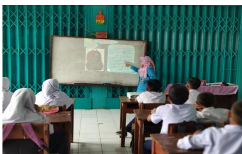
Figure 2. Limited trial implementation at Junior High School, in Sukabumi

The subject matter in the second learning limited trial was writing too short and simple descriptive text. The learning activities undertaken consisted of four stages; observe, ask questions, gather information, process. The teacher first makes apperception, of course, after praying together, then the teacher greets students to check the readiness of students in learning and then takes students one by one to find out the whereabouts of students. After that, the teacher explains the descriptive text. In the activity of observing the teacher, conveying the competencies to be achieved, explaining the purpose of learning and group assignments, then the teacher provides a picture of My House for students to observe.